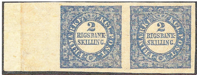
Lot # 558

Since the pair had full left sheet margin and was determined to be plate I, Nos 81-82 it was obvious to link the pair to the two single stamps. - Intense studies later on confirmed that the three individual items without any doubt originally formed an integrated block of four; intensity of colour, the burelage and the placement of the watermarks absolutely prove this fact.